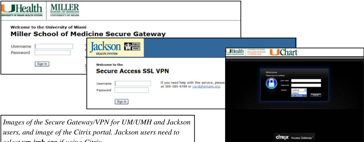
Images of the Secure Gateway/VPN for UM/UMH and Jackson users, and image of the Citrix portal. Jackson users need to select um-jmh.org if using Citrix.